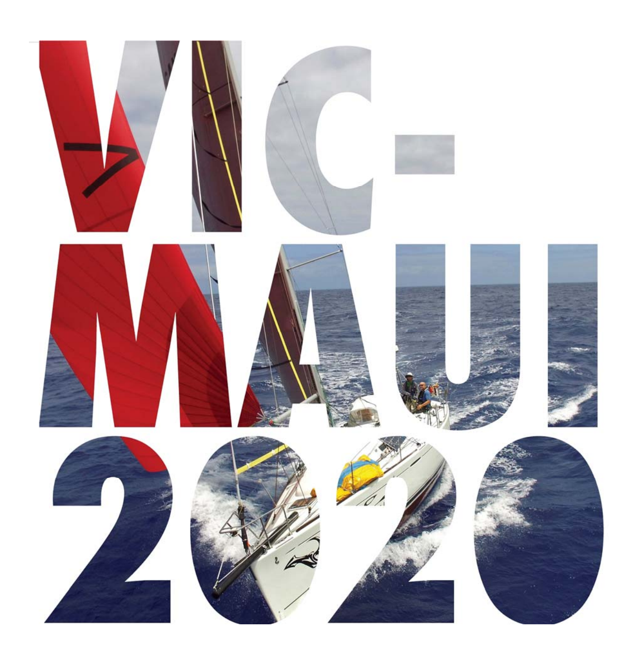
2020 Victoria to Maui International Yacht Race