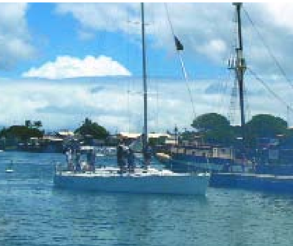
Voodoo Child pulls into Lahina Harbour, Maui.